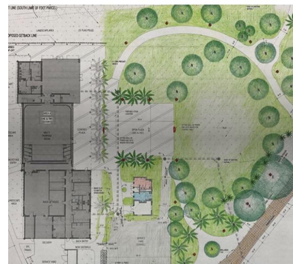
Proposed East Park