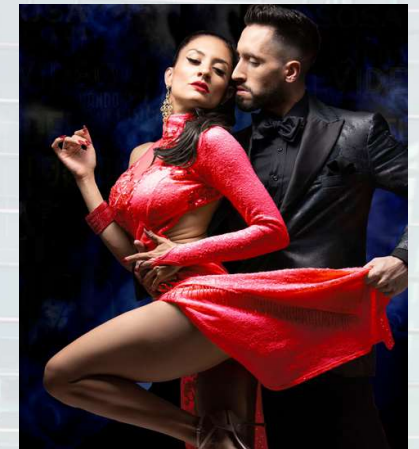
Tango Lovers Volver October 15