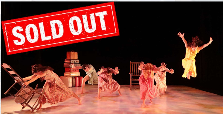
Sarasota Contemporary Dance Sept 29 - Oct 1