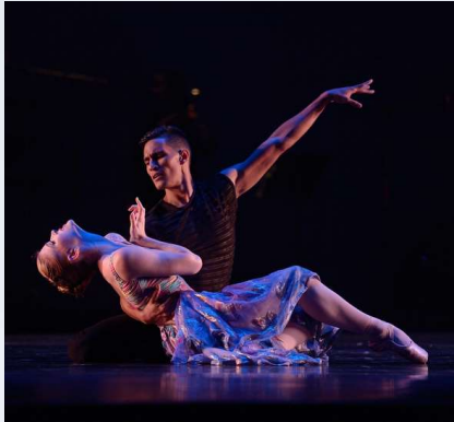
Dimensions Dance Theatre Summer July 15 - 16