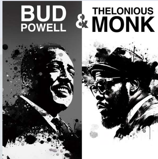
Legends of Bebop: Monk & Powell July 8