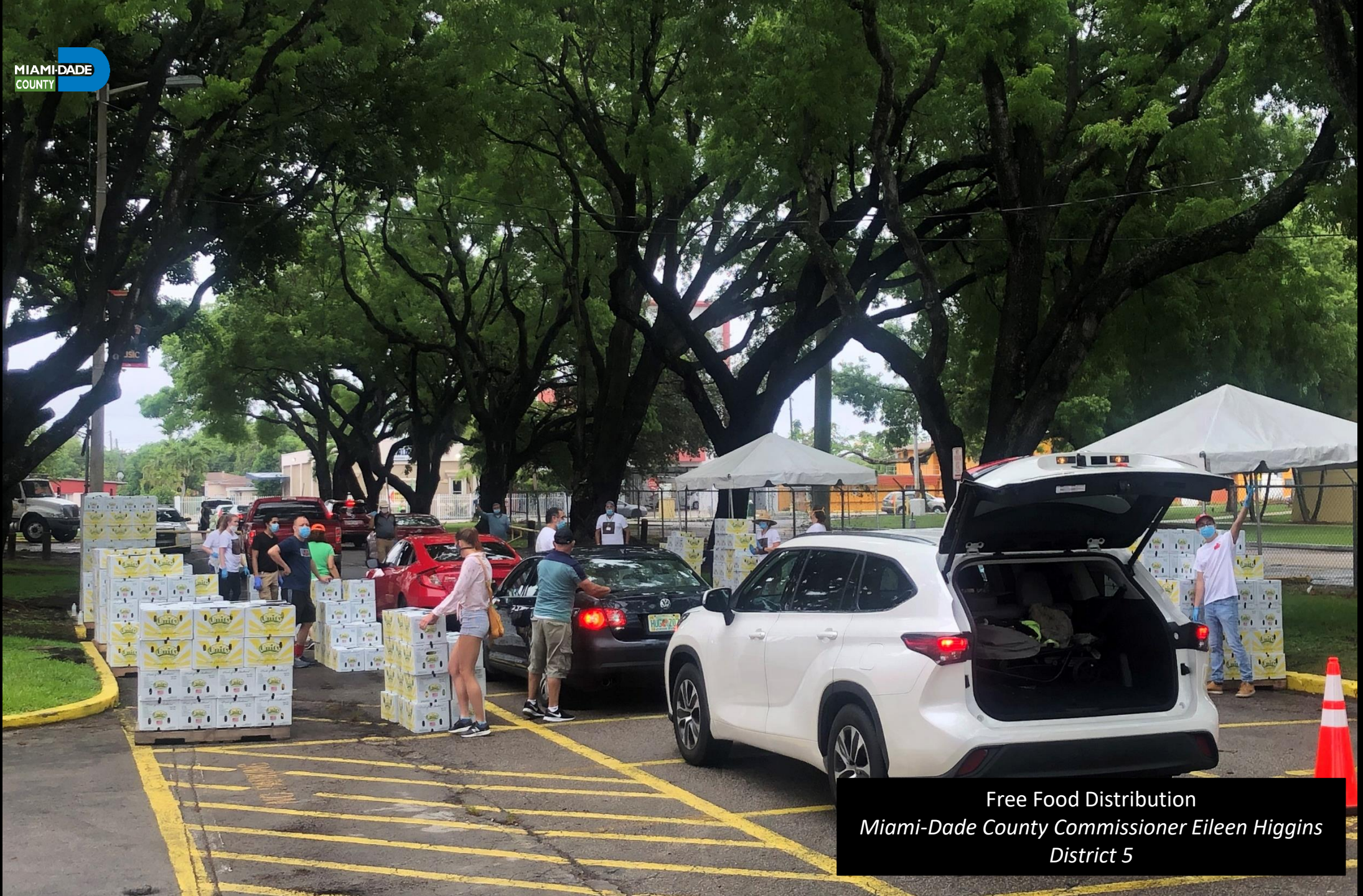
Free Food Distribution Miami-Dade County Commissioner Eileen Higgins District 5