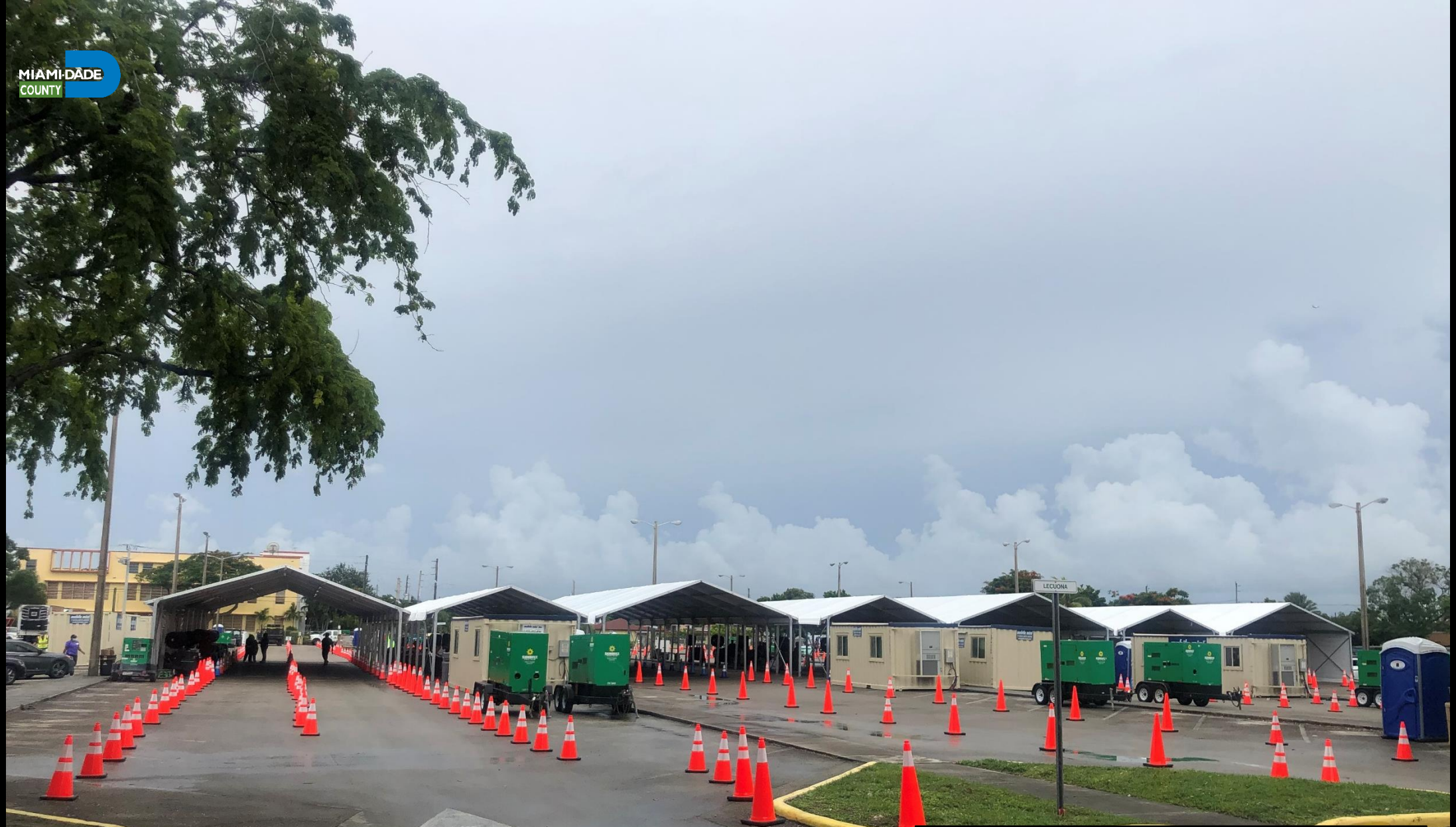
Drive-Through Testing Site Florida Division of Emergency Management July-August 2020