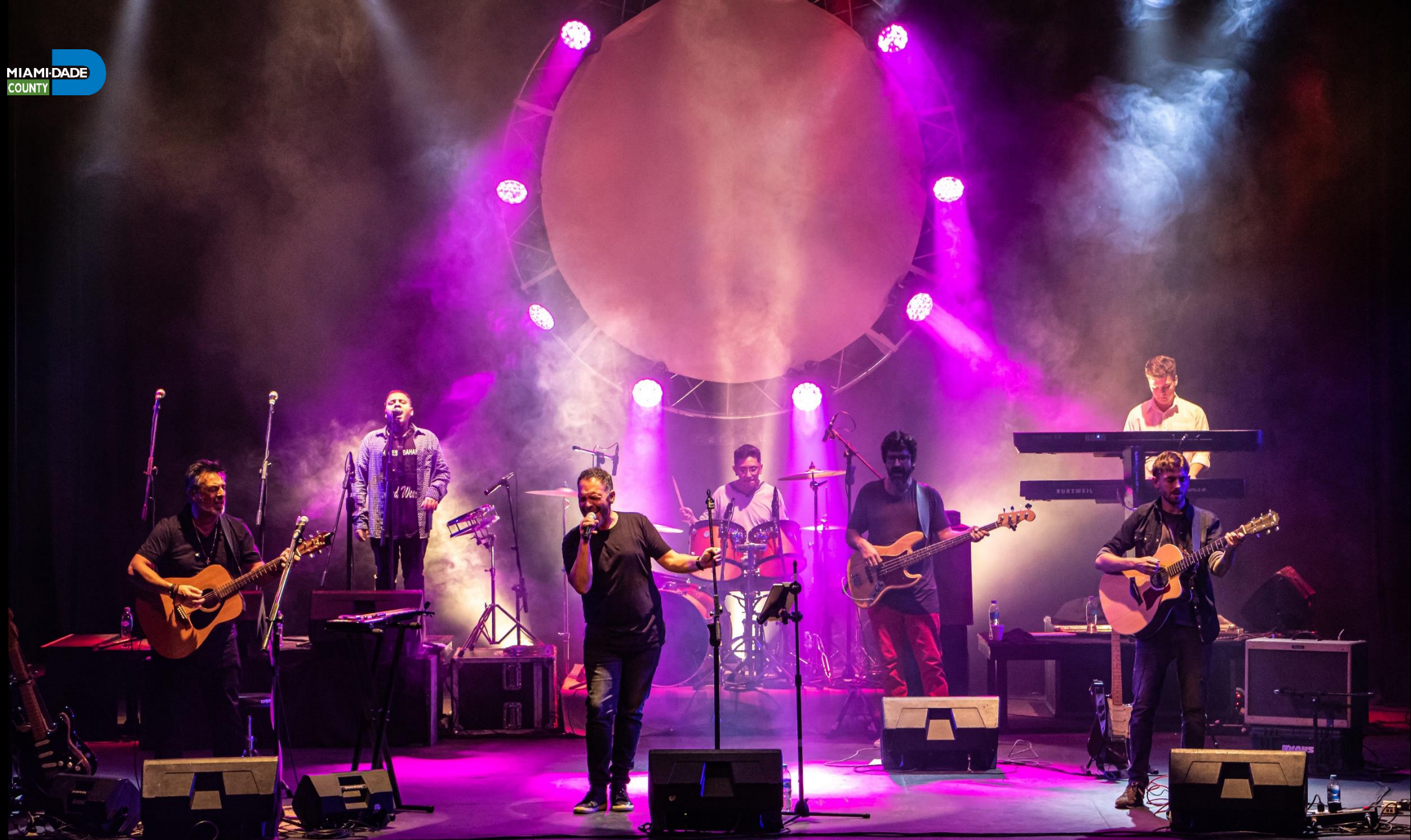
PRISMA Pink Floyd Experience December 2022