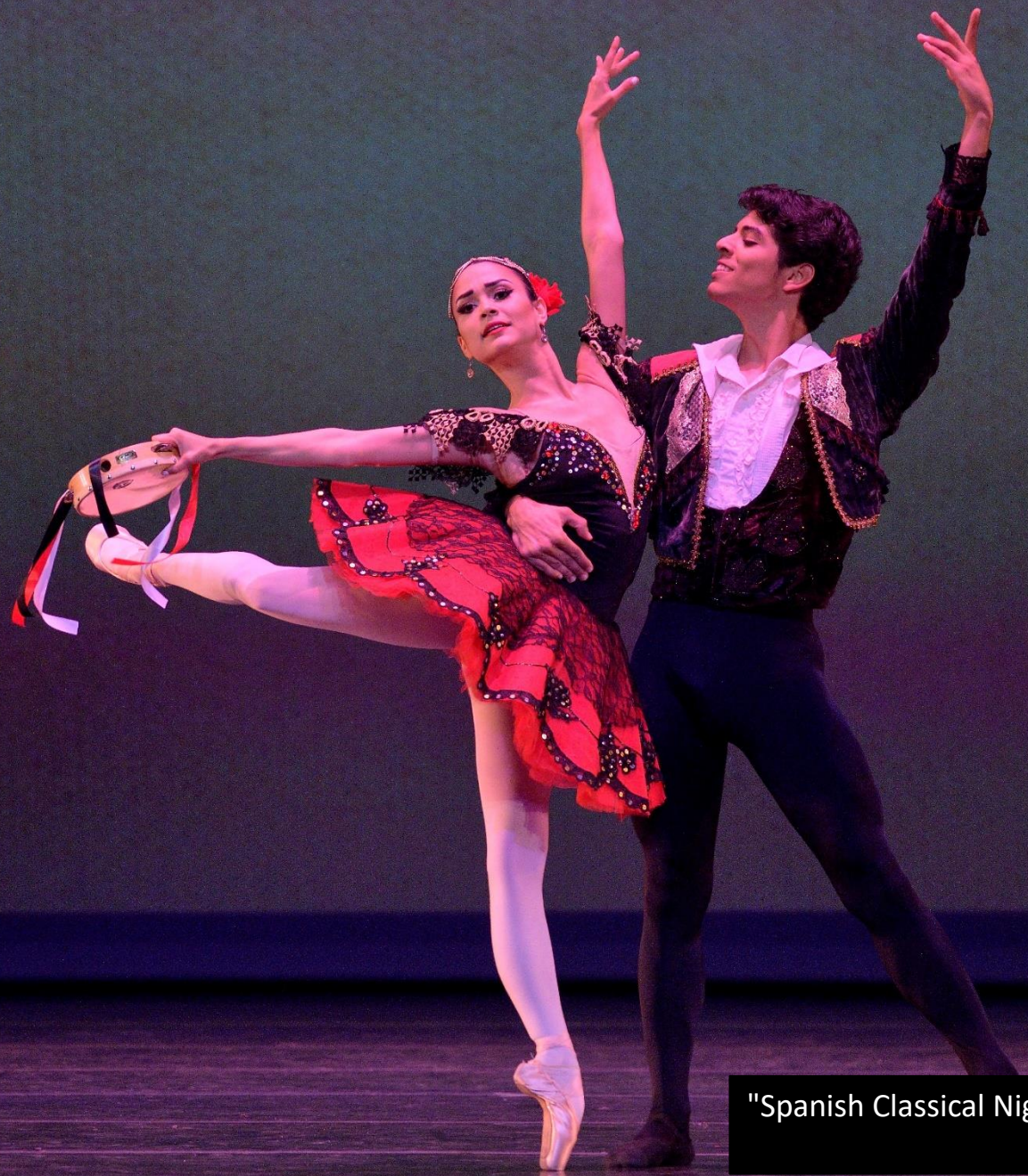
"Spanish Classical Night" by Cuban Classical Ballet of Miami February 2023