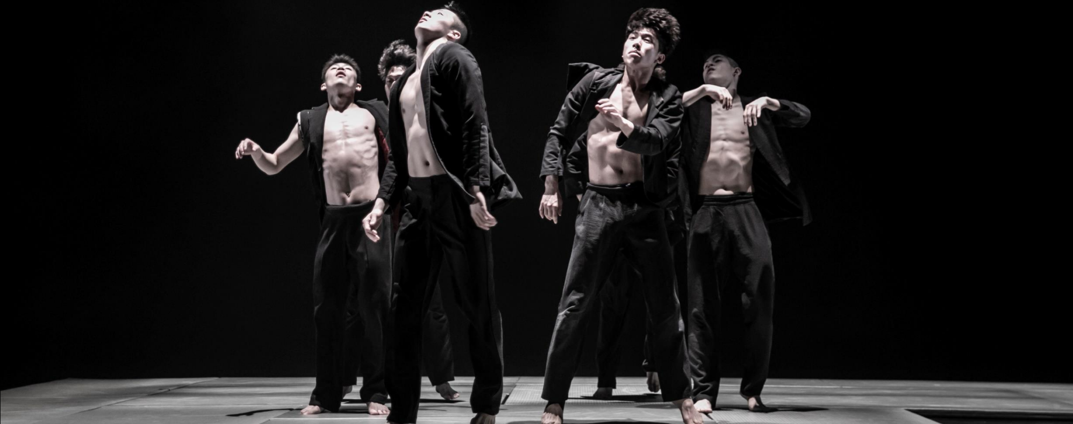
“Balance & Imbalance” & “Judo” by Bereishit Dance Company March & April 2023