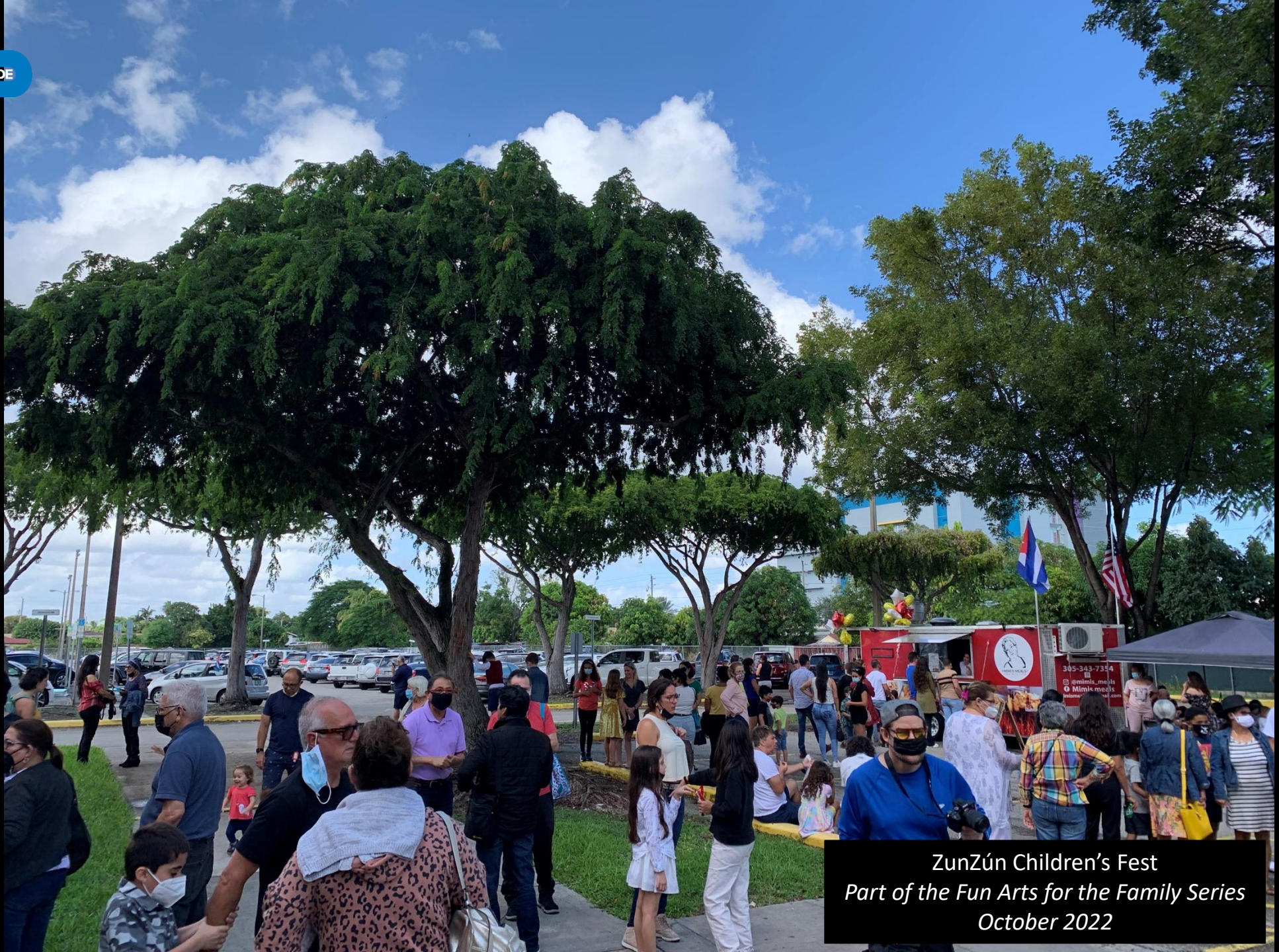
ZunZún Children's Fest Part of the Fun Arts for the Family Series October 2022