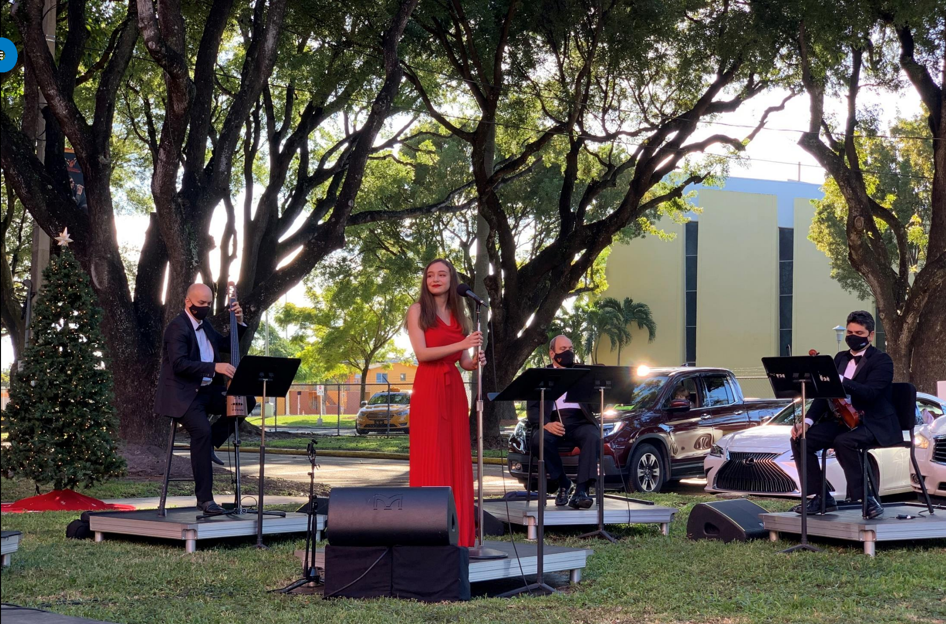
"Christmas is in the Air with Hope" featuring Florida Chamber Orchestra Part of A Very Merry Holiday Season Series December 2020