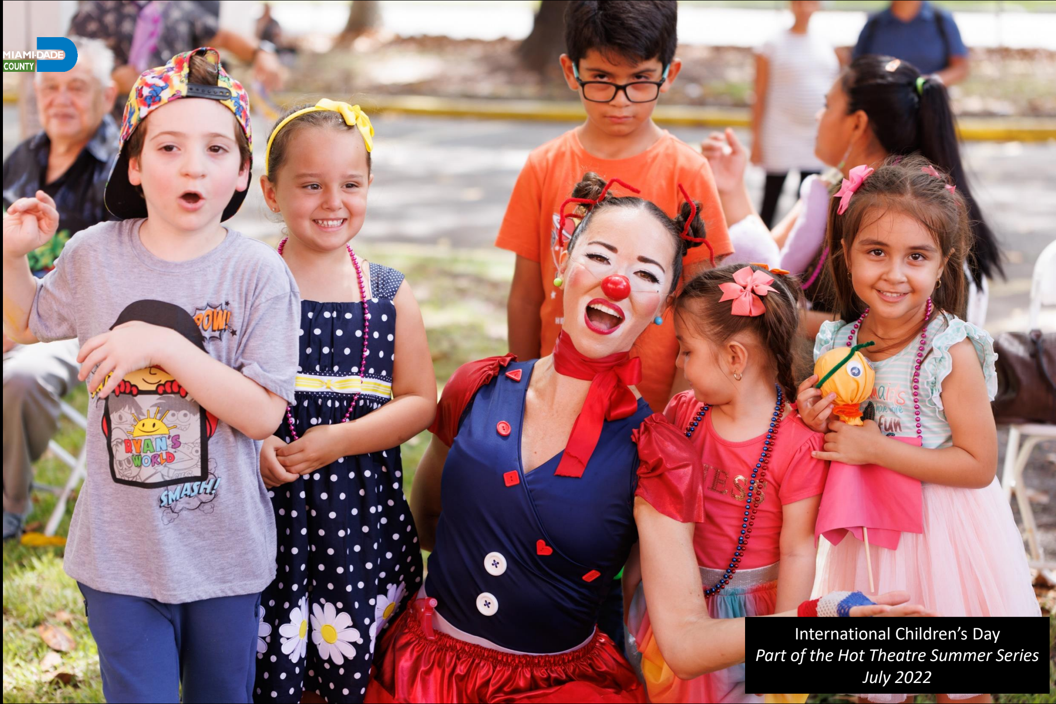
International Children's Day Part of the Hot Theatre Summer Series July 2022