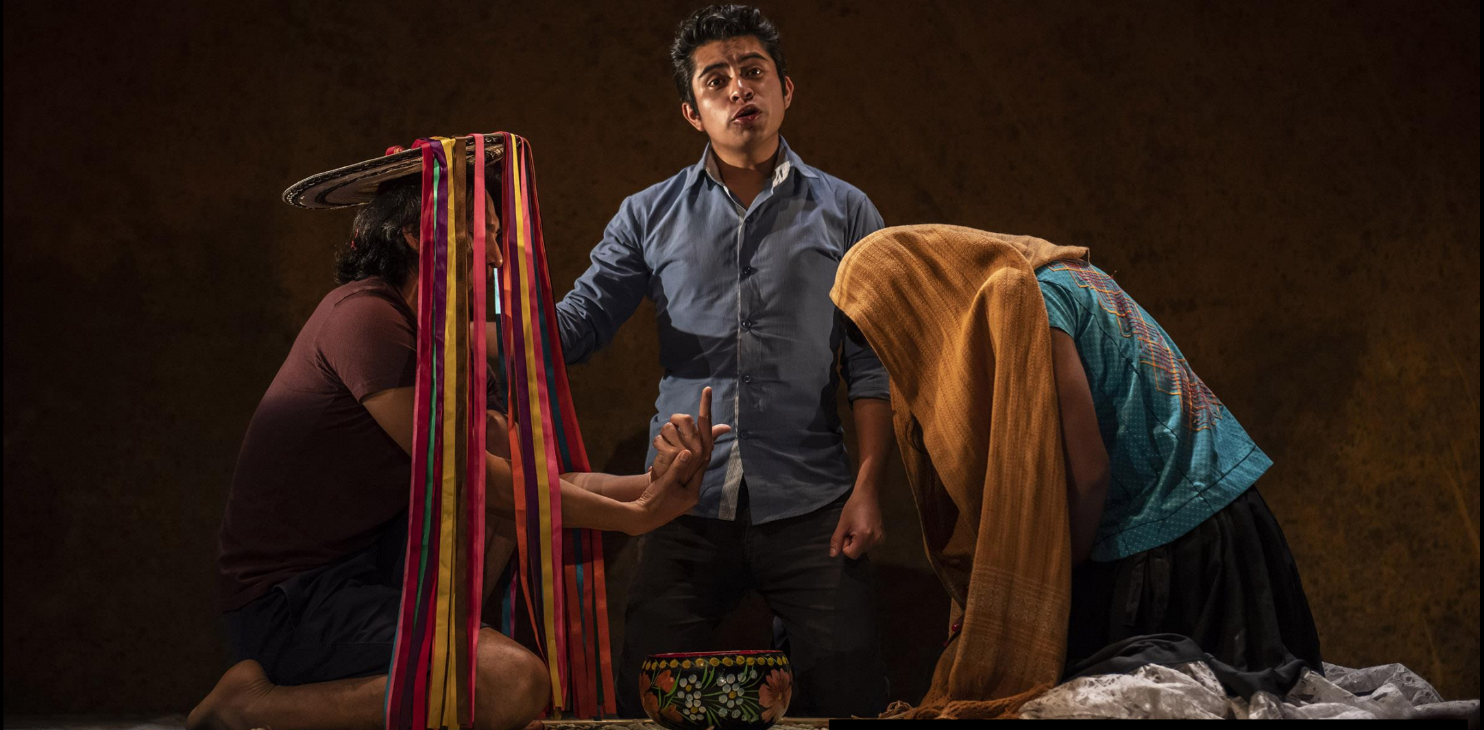
"Andares" by Makuyeika Theatre Collective April 2022