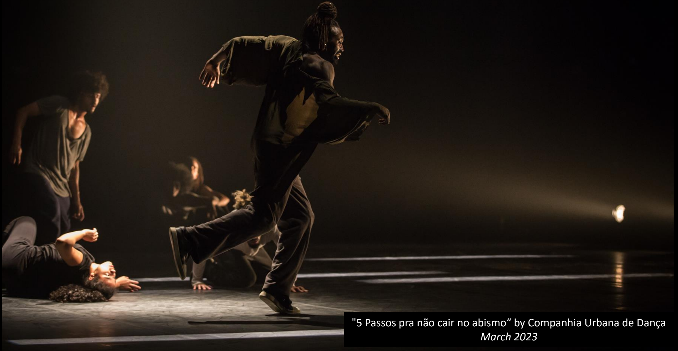
"5 Passos pra não cair no abismo" by Companhia Urbana de Dança March 2023