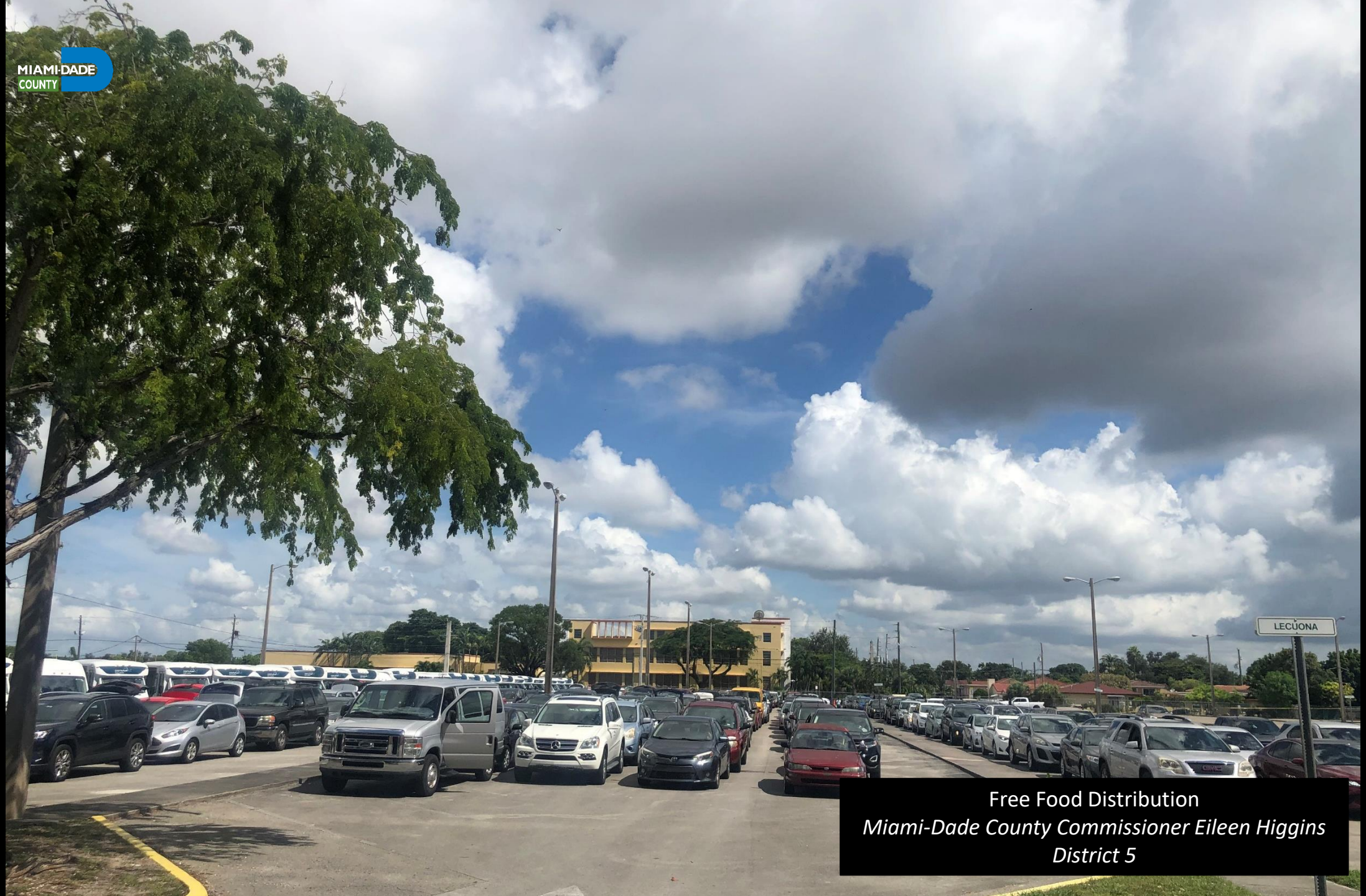
Free Food Distribution Miami-Dade County Commissioner Eileen Higgins District 5