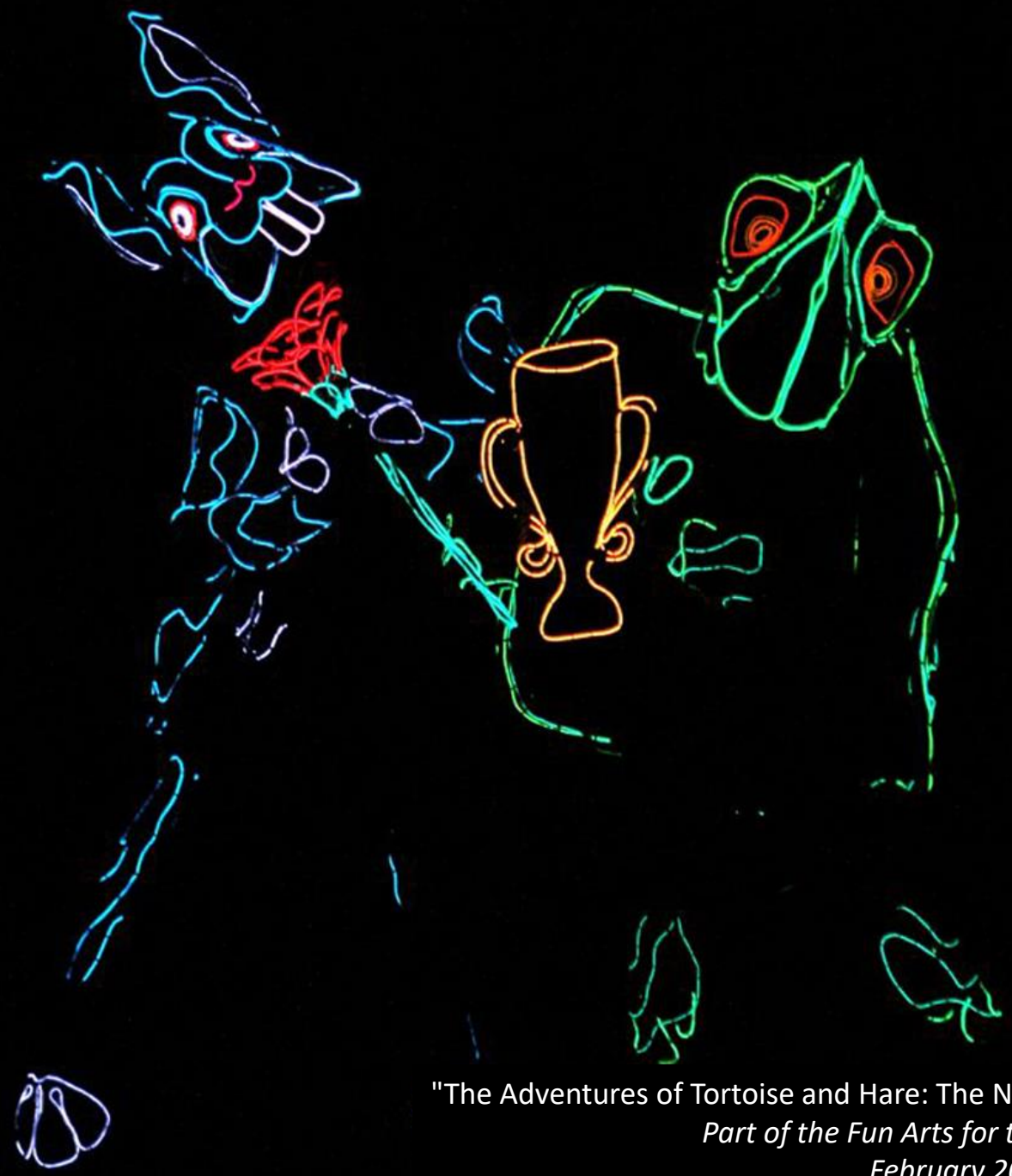
"The Adventures of Tortoise and Hare: The Next Generation" by Lightwire Theater Part of the Fun Arts for the Family Series February 2023