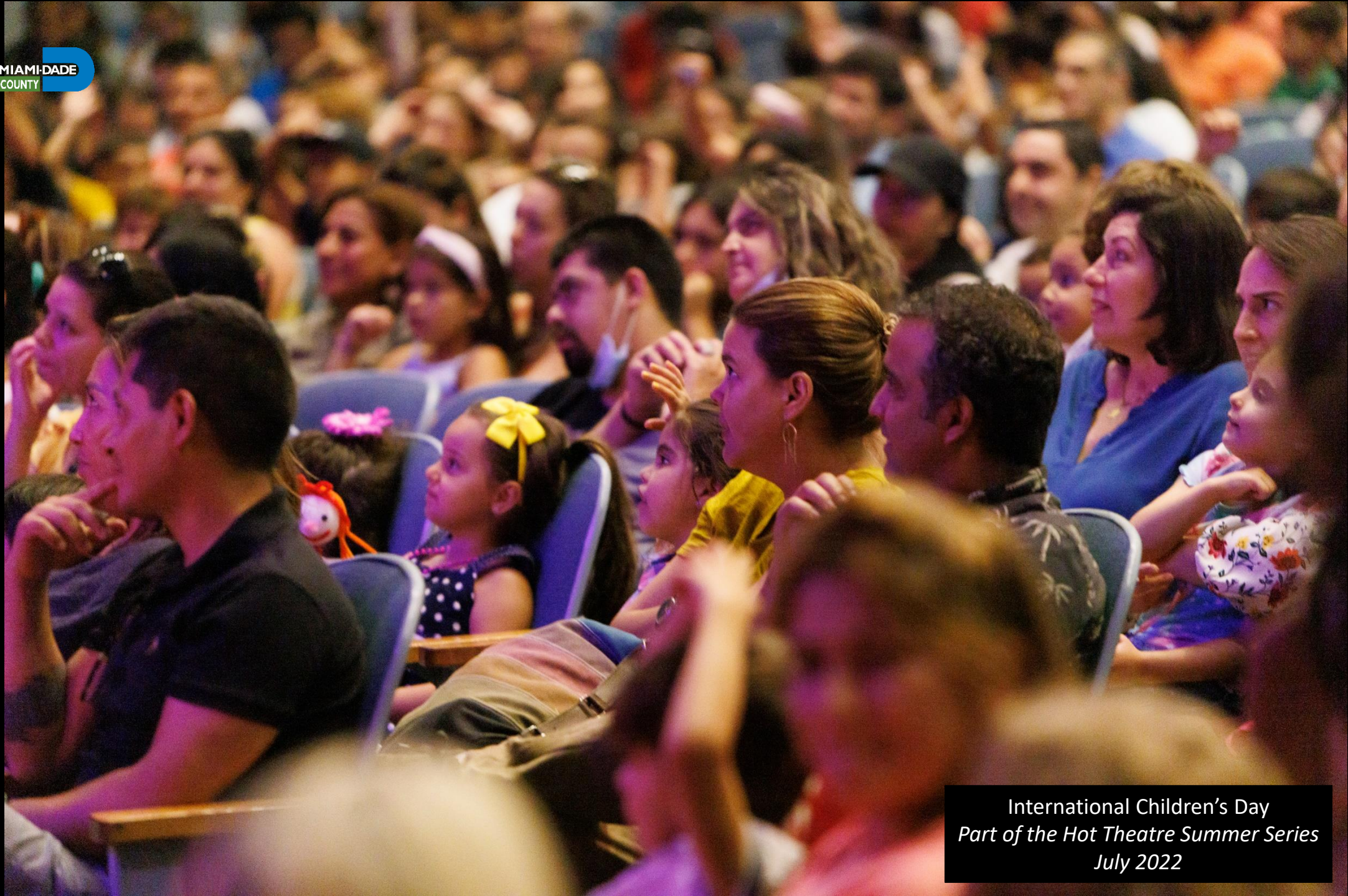
International Children's Day Part of the Hot Theatre Summer Series July 2022