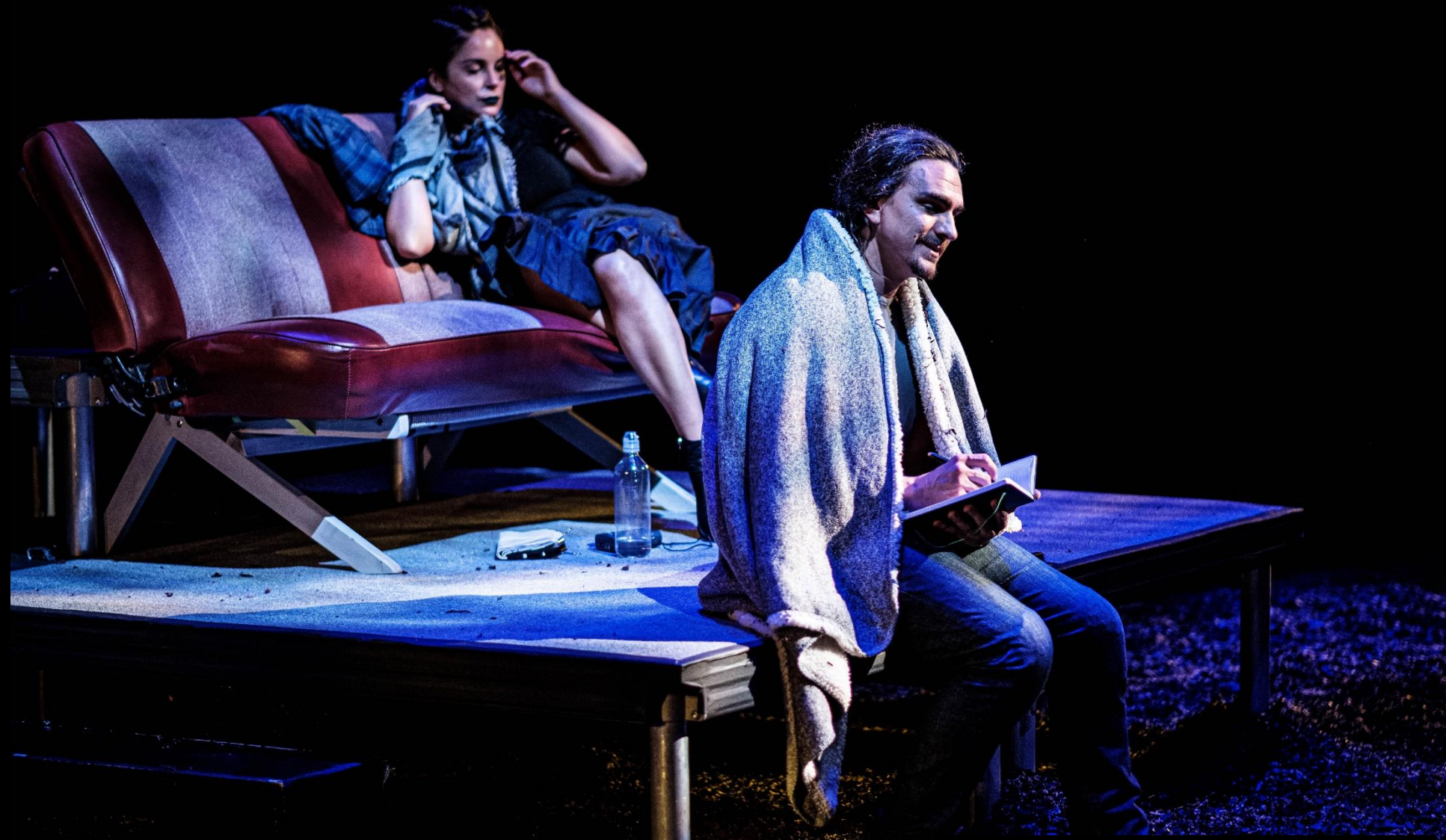
World Premiere "Kisses Through the Glass" by Nilo Cruz July-August 2022