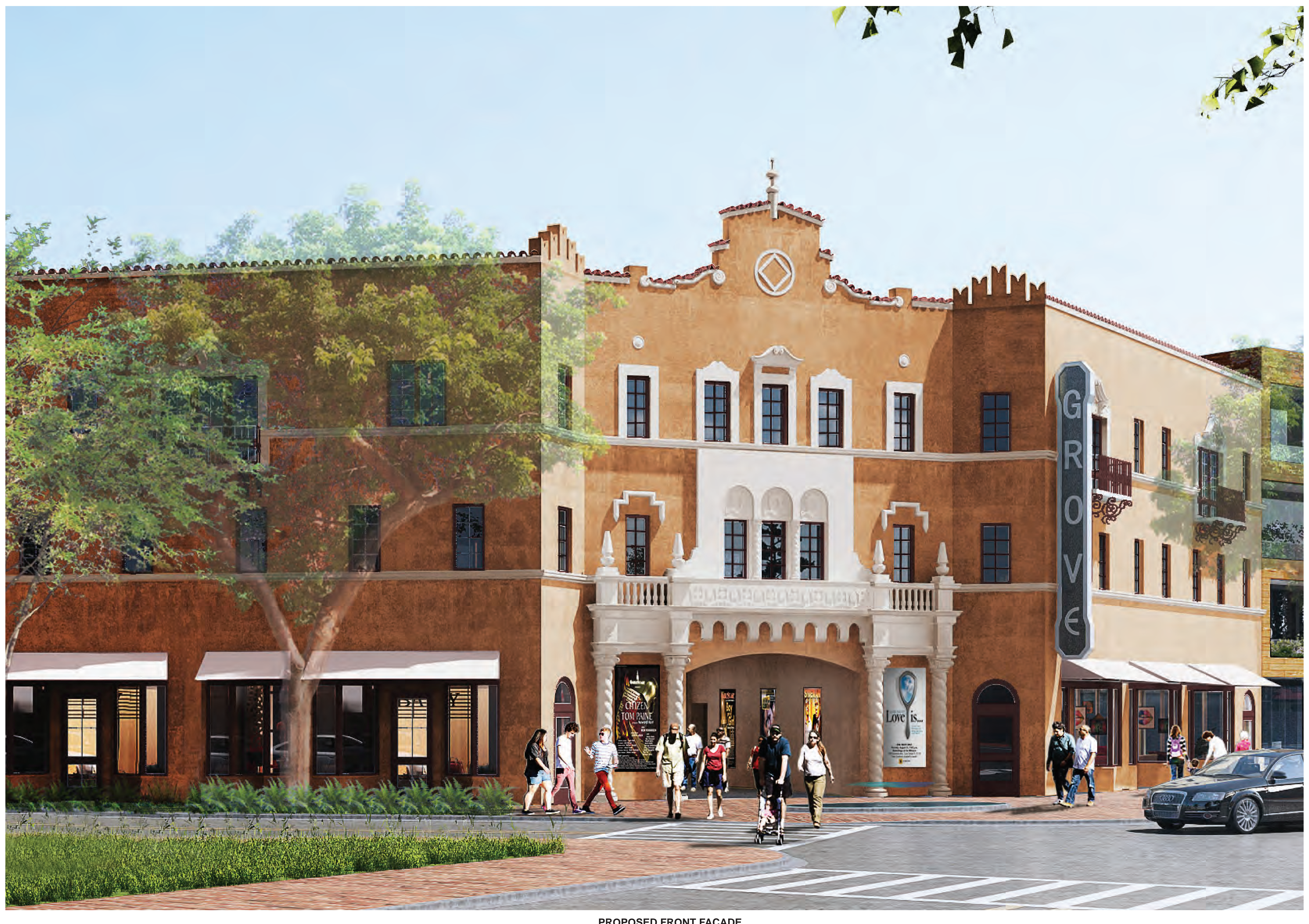
PROPOSED FRONT FACADE