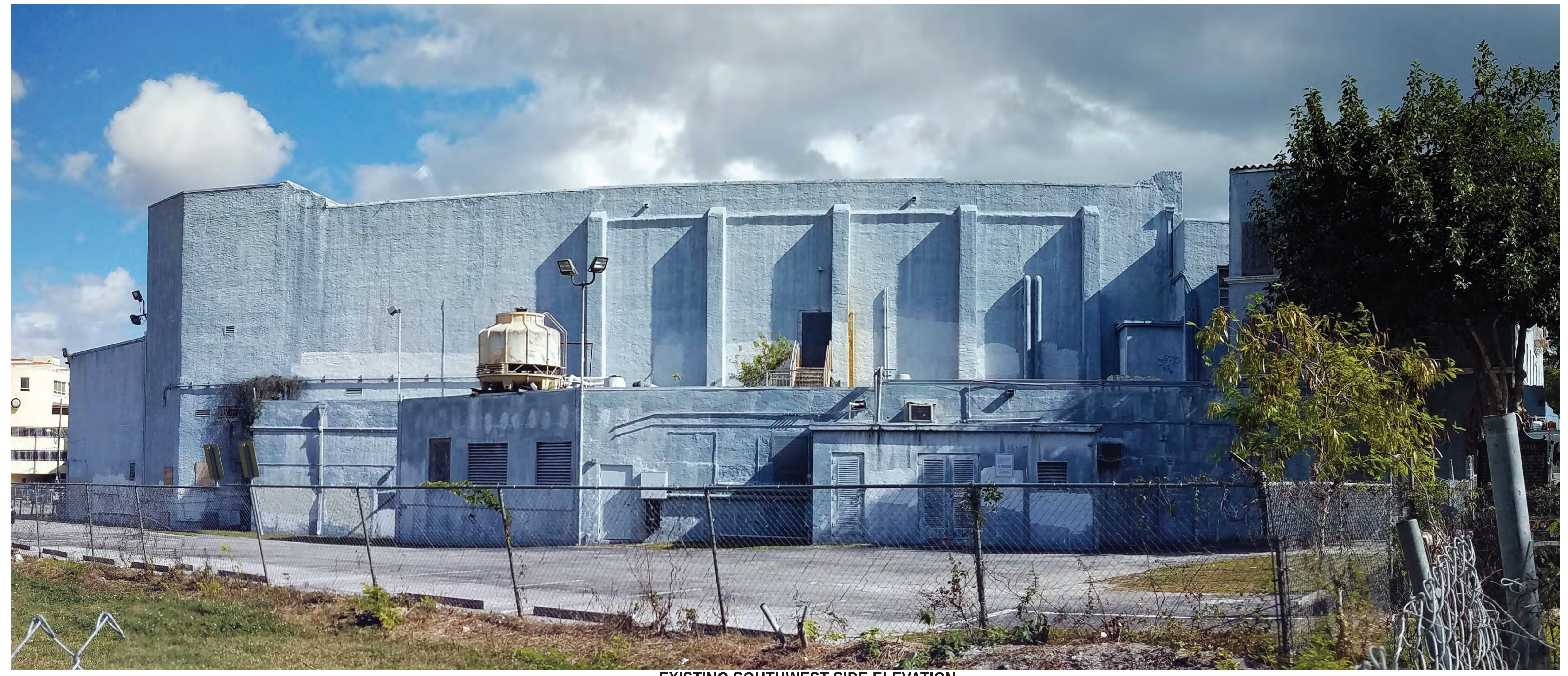
EXISTING SOUTHWEST SIDE ELEVATION