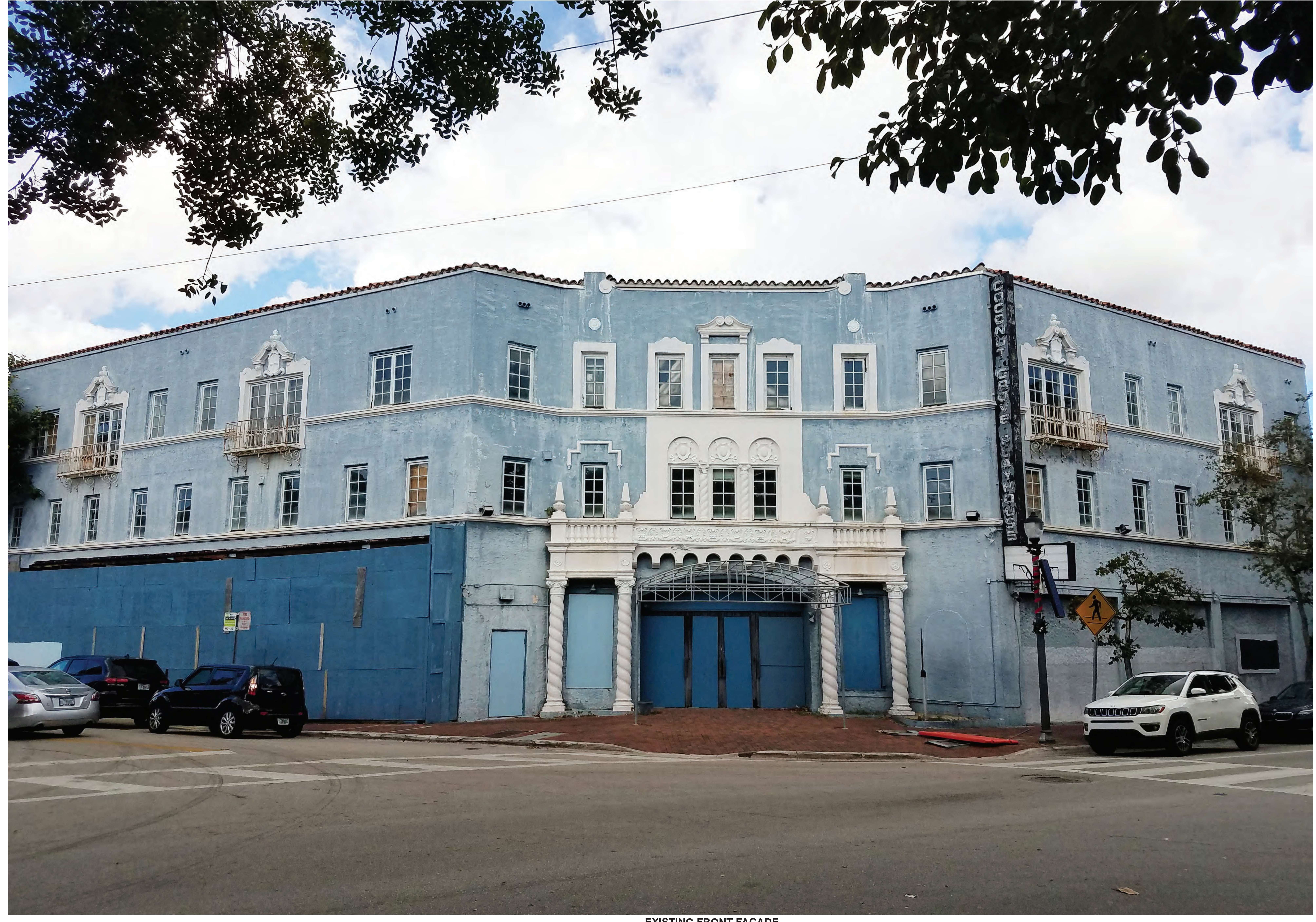
EXISTING FRONT FACADE