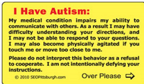
Wallet Card justdigit.org/