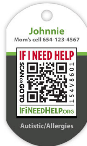
Wearable QR Code ifineedhelp.org/