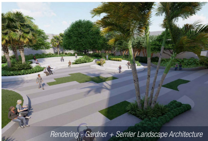
Rendering - Gardner + Semler Landscape Architecture

The first phase of work will provide much needed amenities for backstage users and renters with an improved and expanded loading dock to accept large scale sets, scenery and equipment, much needed storage, dressing rooms, offices, and break rooms for artists and technical personnel. The expansion includes the reconfiguration of the service entrance to provide direct access to the new loading dock area, making it easier for large trucks to enter and exit the site.