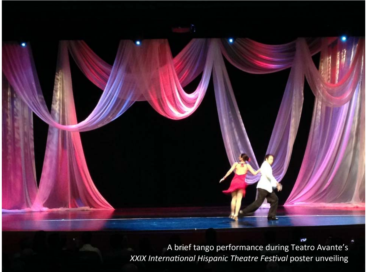
A brief tango performance during Teatro Avante's XXIX International Hispanic Theatre Festival poster unveiling