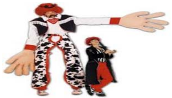
Mixed Up Fairytales Page Turner Adventures July 29, 2014 @ 10 AM