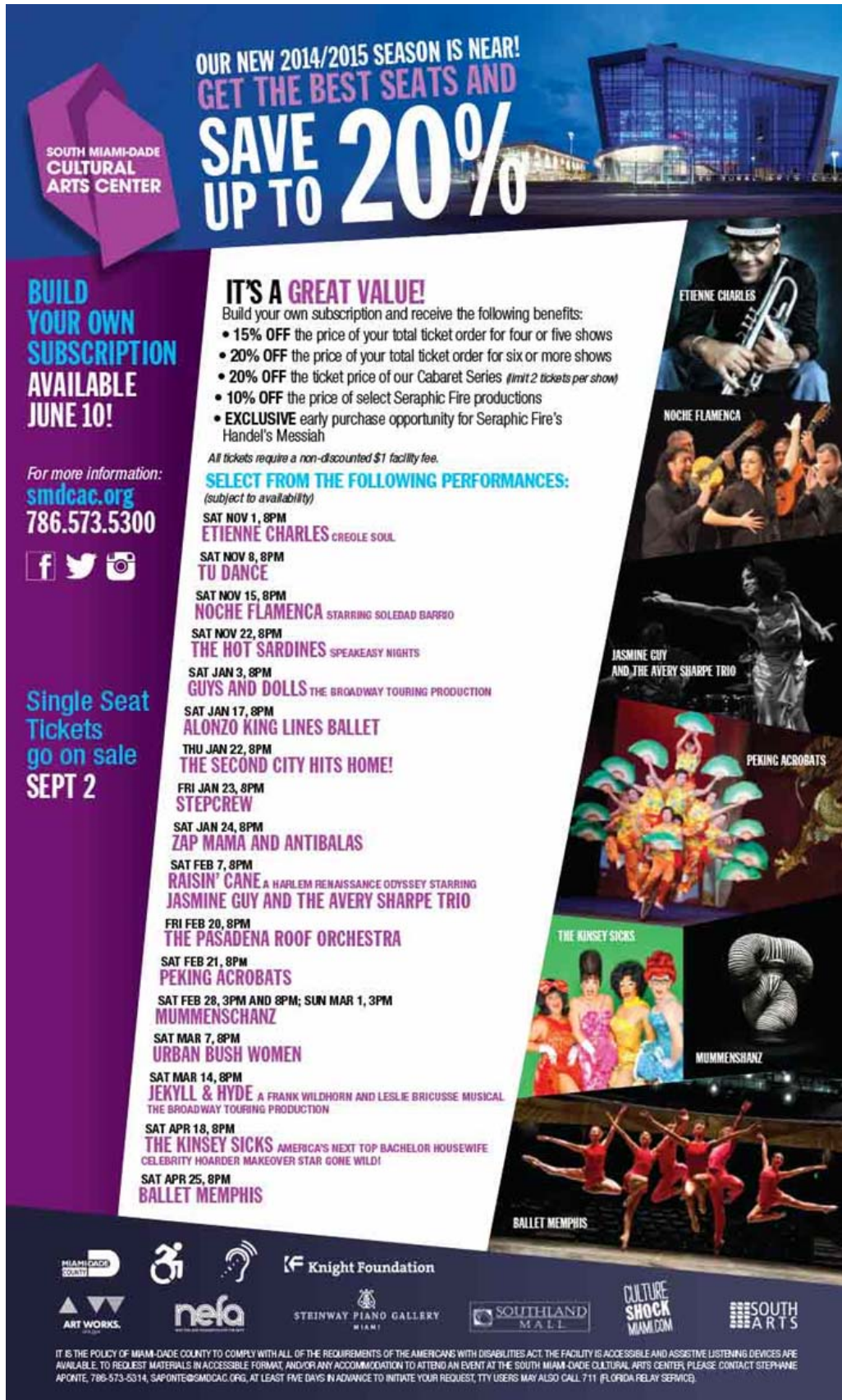
Promotional flyer/eblast for 14-15 Subscription Series