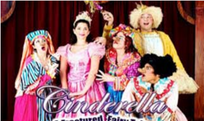
Cinderella—A Fractured Fairytale Fantasy Theater Factory June 17, 2014 @ 10 AM