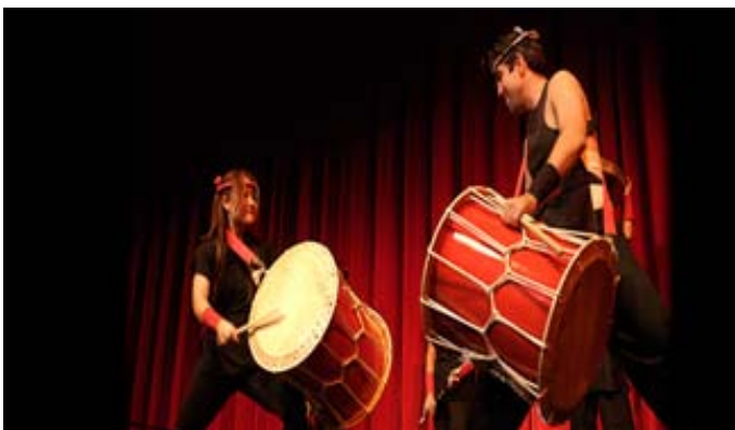
Japanese Taiko Drummers and Koto Players Fushu Daiko July 14, 2014 @ 10 AM