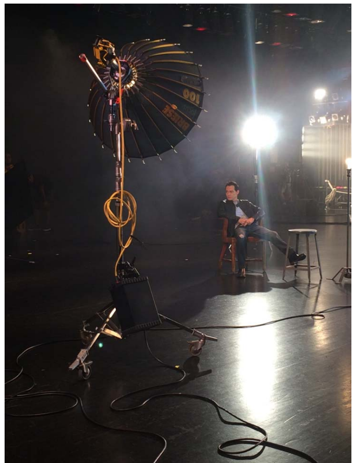
Singer Marc Anthony taking a break between pictures