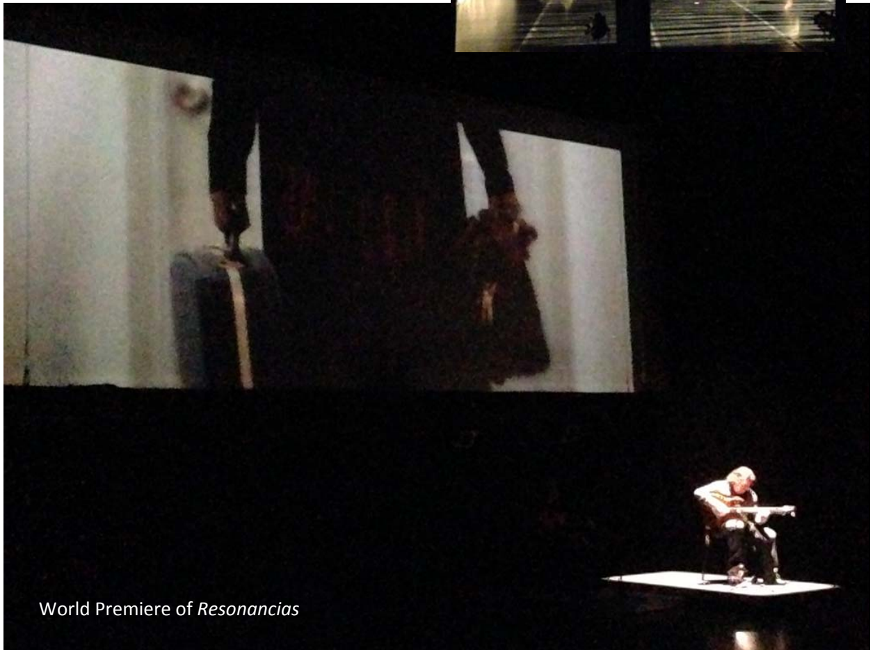
World Premiere of Resonancias