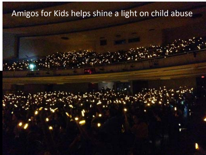
Amigos for Kids helps shine a light on child abuse