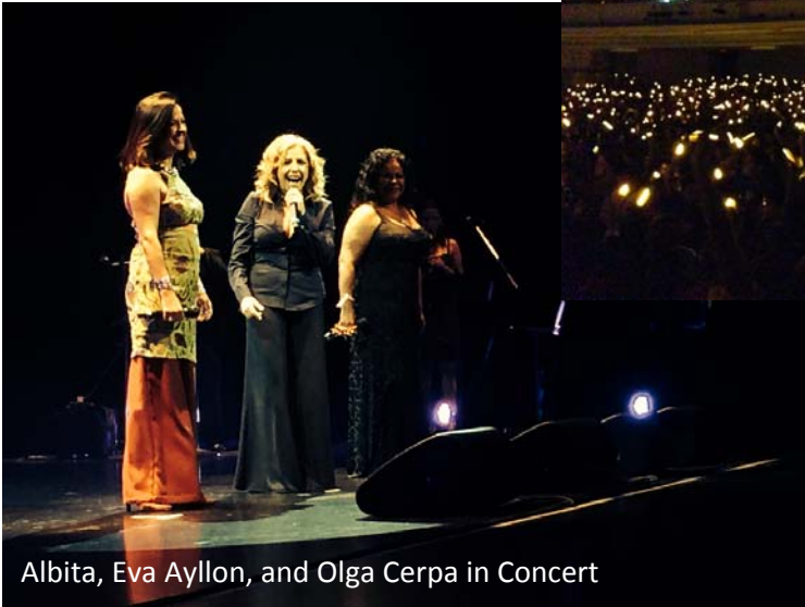
Albita, Eva Ayllon, and Olga Cerpa in Concert